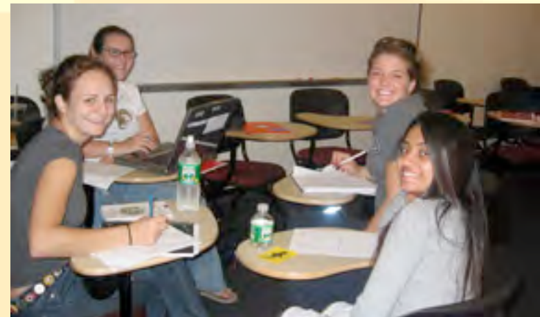
Simmons College, 2006